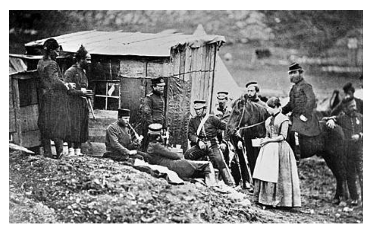
British soldiers and a regimental soldier's wife in their camp during the Crimean War.