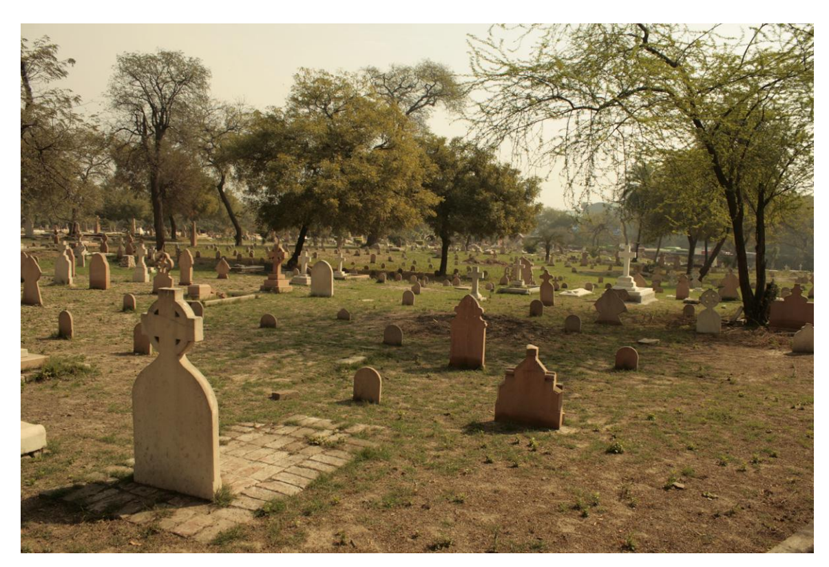
British military cemetery, Dehli, India.