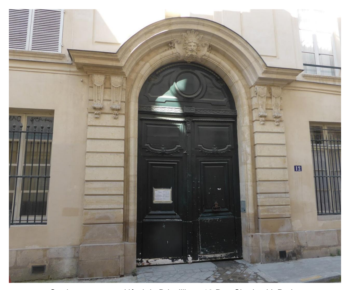
Carriage entrance, Hôtel de Brinvilliers, 12 Rue Charles-V, Paris.