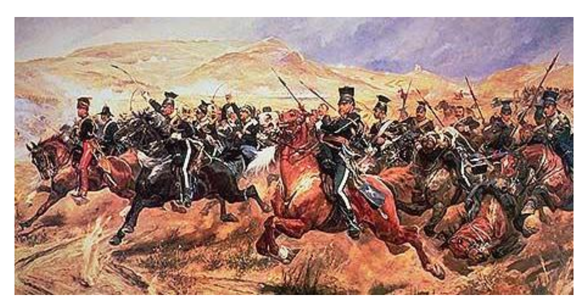
Painting representing the charge of the Light Brigade at the Battle of Balaklava.