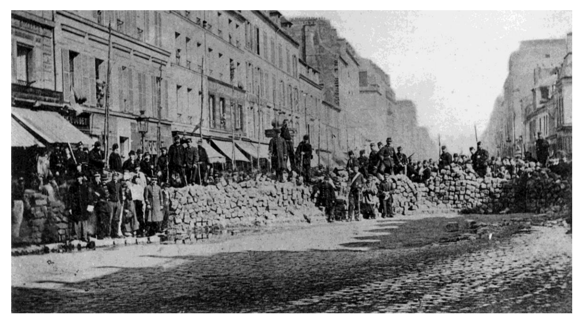
Insurgents' barricade on Rue Lafayette during the Paris Commune, March 1871.