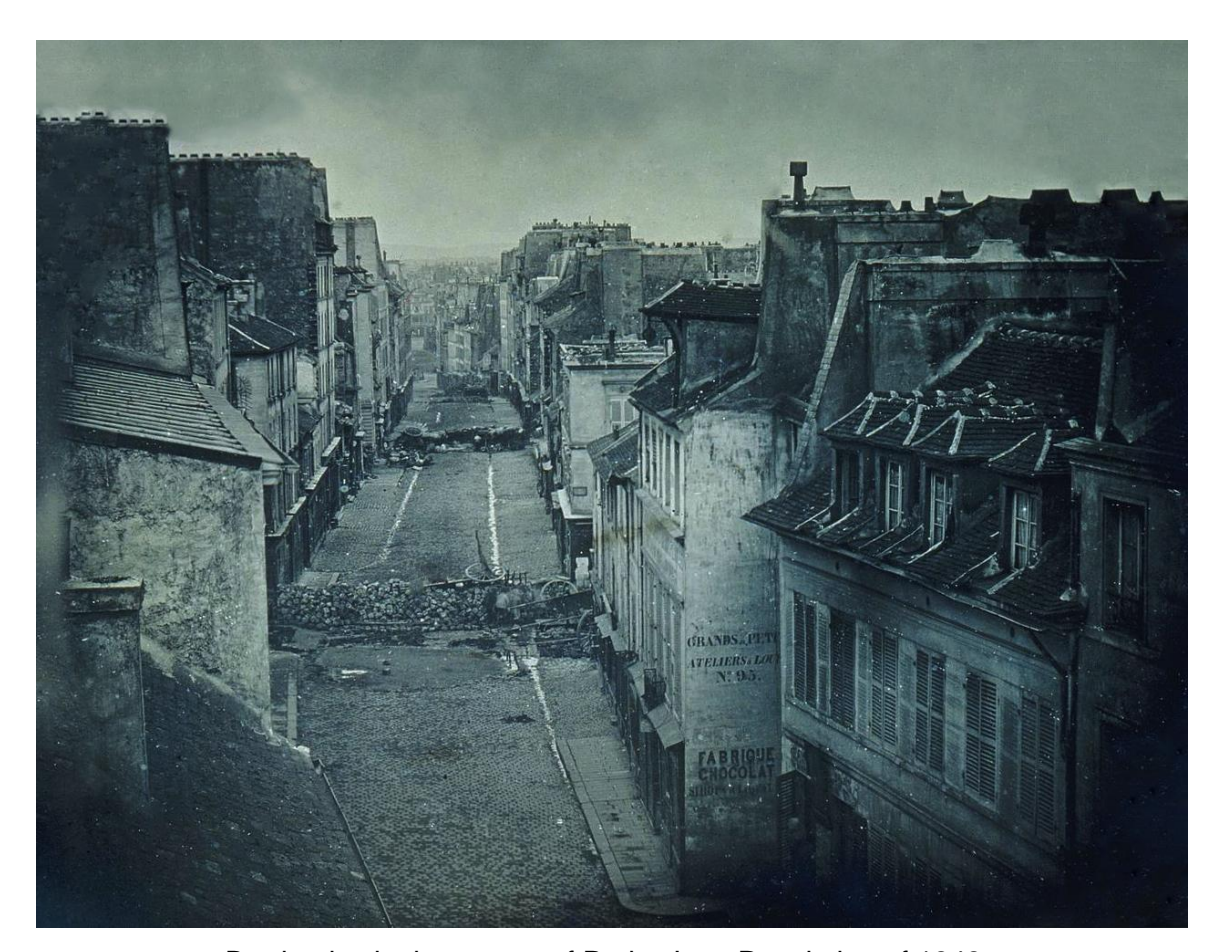
Barricades in the streets of Paris, June Revolution of 1848.